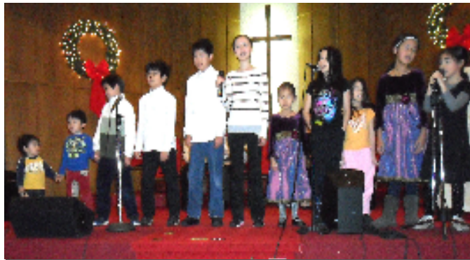
Children at Wesley Chapel performing at the Christmas concert