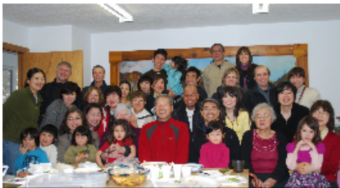
Congregation of the Banff Grace Japanese Christian Church

accompanying photo is his baptismal service. He is now an energetic Christian who attends prayer meetings, gospel times and Sunday worship services regularly.